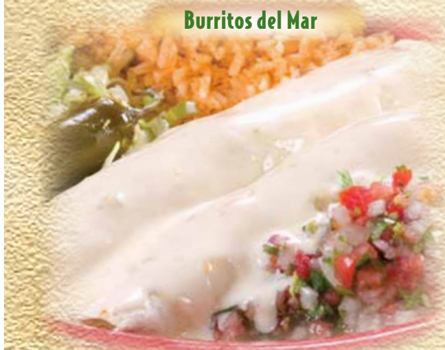
Burritos del Mar