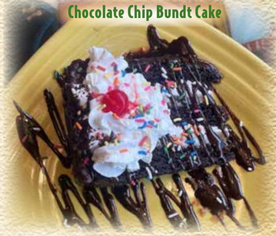
Chocolate Chip Bundt Cake