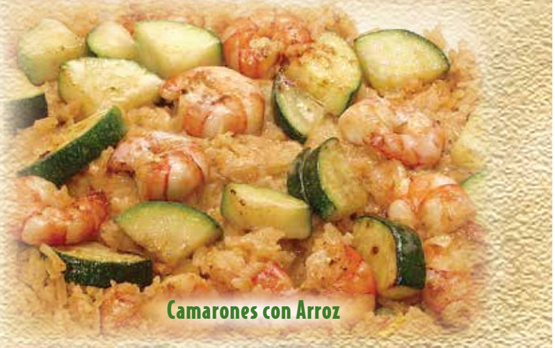
Camarones con Arroz