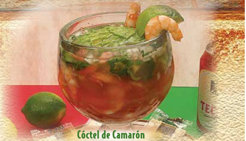
Cóctel de Camarón

Grilled BBQ chicken breast, lettuce, tomatoes, bacon and American cheese on a bun – 9.75