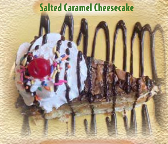
Salted Caramel Cheesecake

Coca-Cola, Diet Coke, Cherry Coke, Mello Yello, Sprite, Root Beer, Fanta, Pibb Xtra, Lemonade Raspberry Iced Tea, Peach Iced Tea, Strawberry Iced Tea, Mango Iced Tea, Raspberry Lemonade, Peach Lemonade, Strawberry Lemonade, Mango Lemonade, Water Lemonade, Orange Lemonade, Shirley Temple