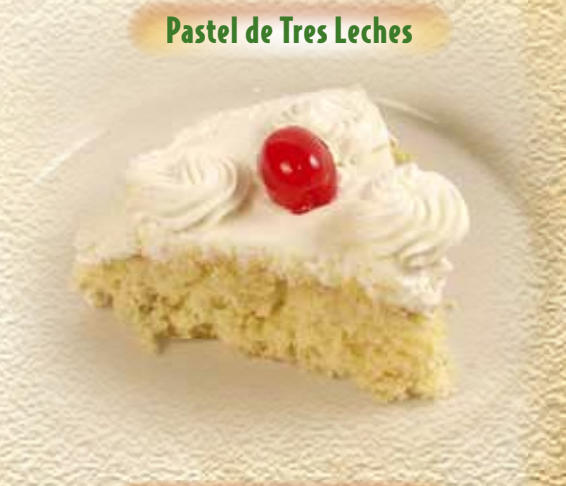
Pastel de Tres Leches